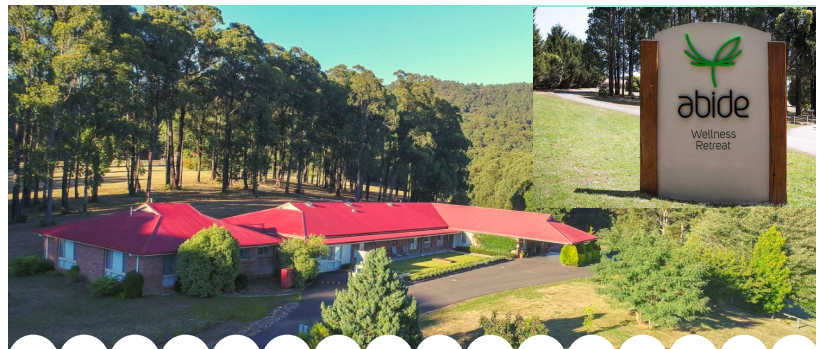
291 Maroondah Hwy Narbethong Victoria 3778